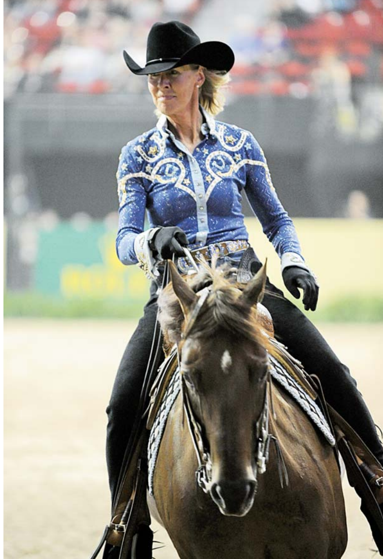
COWGIRL UP: At the International Reining Celebrity Challenge during the 2009 Rolex FEI World Cup Finals in Las Vegas

The next day, everybody had totally discarded me, including myself, and I felt very defeated. Robert Dover was in the warm-up arena with me, and he really got me out of feeling defeated. He got me to an OK place, and I went in and had one of the absolute best tests of my life. It was like the horse was guided by a higher force. I remember com-